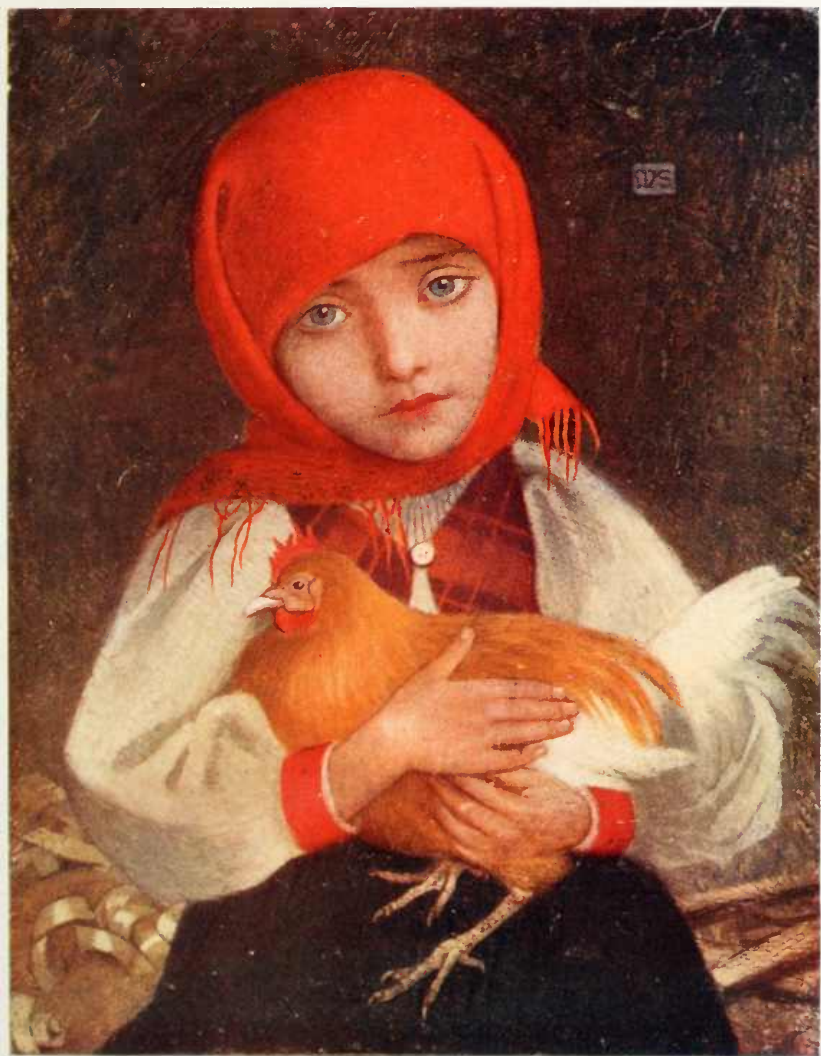
A PEASANT CHILD WITH A FOWL, IN THE MOUNTAINOUS DISTRICT OF TÁTRA IN SOUTH-EASTERN HUNGARY.