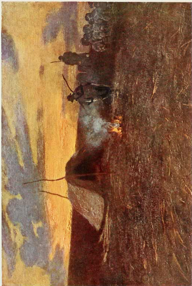
MAGYAR SHEPHERDS IN EASTERN HUNGARY.