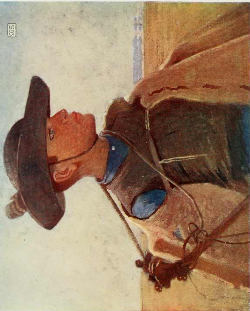
A YOUNG HUNGARIAN BOY ON THE GREAT PUSZTA, OR DESOLATE PLAIN OF HORTOBÁGY.