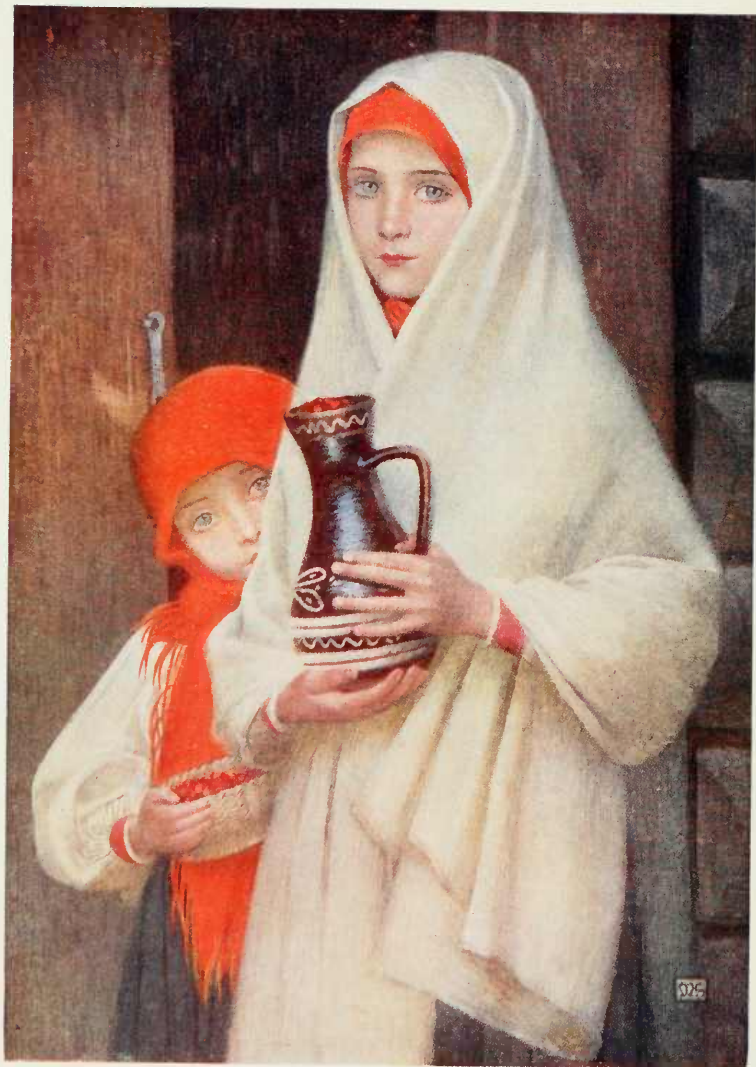
TWO YOUNG PEASANTS WITH FRESHLY GATHERED WILD STRAWBERRIES.