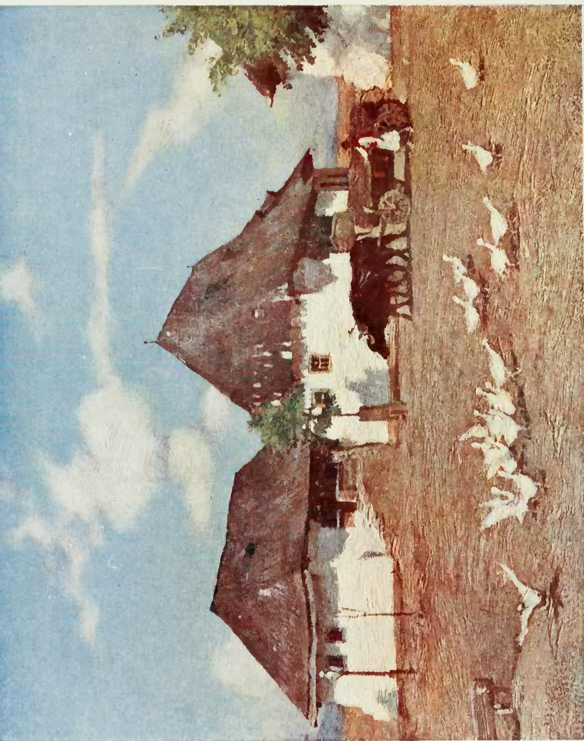
PICTURESQUE COTTAGES IN TRANSYLVANIA.