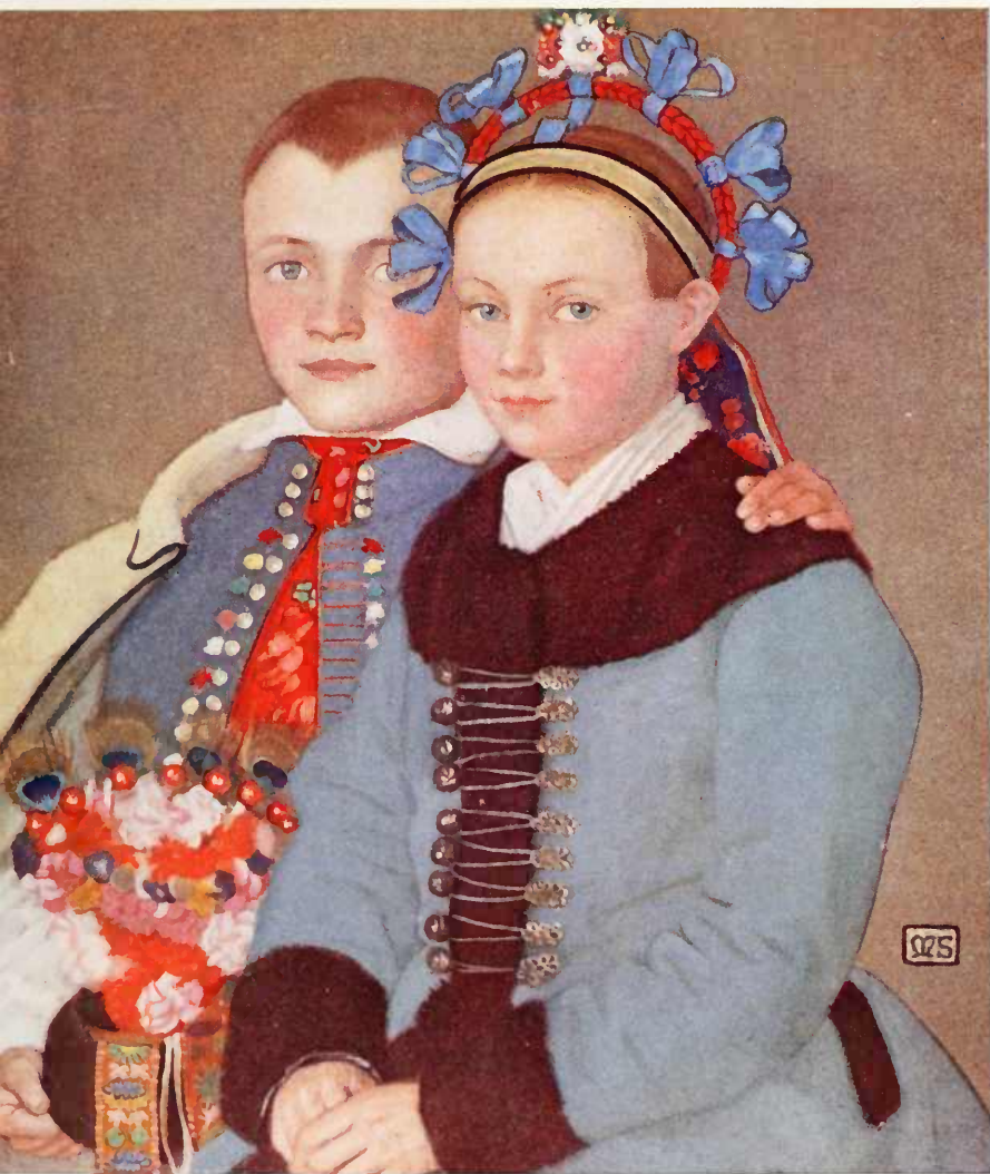
YOUNG HUNGARIAN PEASANTS ENGAGED TO BE MARRIED.