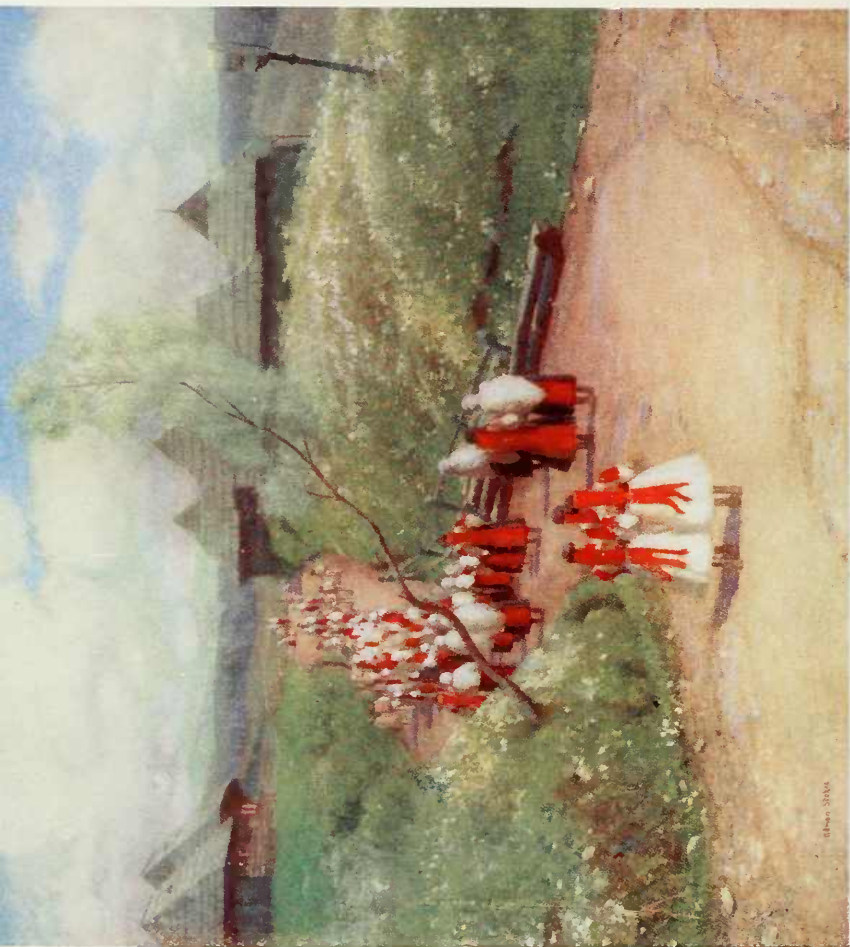
VILLAGERS RETURNING FROM CHURCH, ZSDJAR.