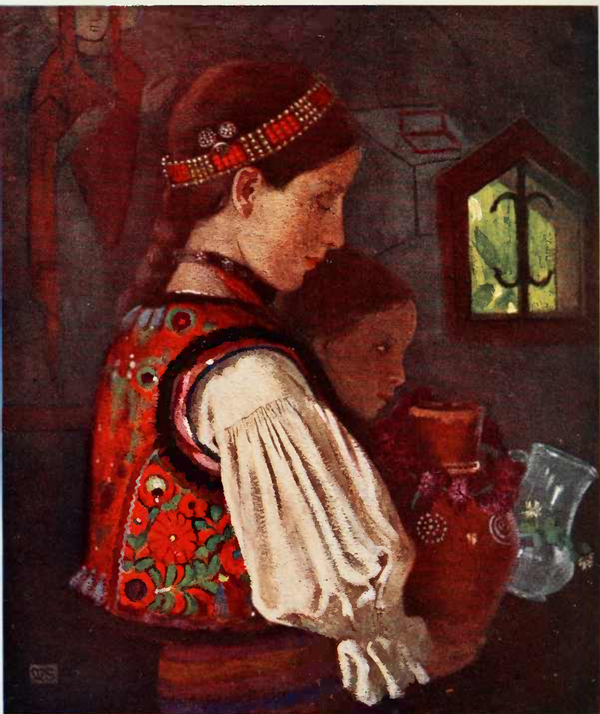
AN OLD CUSTOM IN THE GREEK CHURCH AT DESZE. ROMANIAN CHILDREN BRINGING WATER TO BE BLESSED.