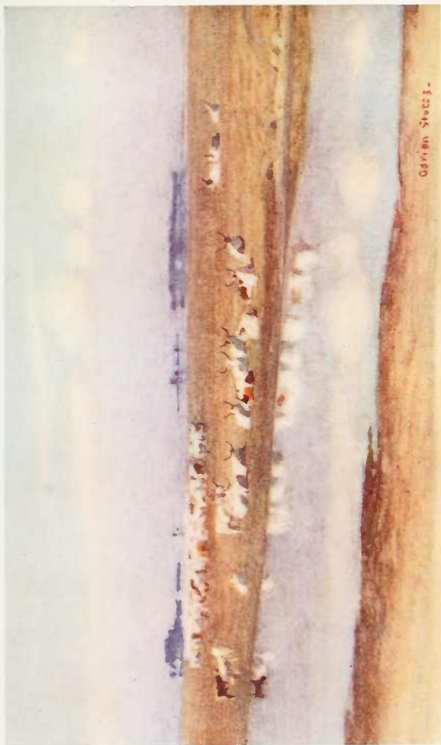
CATTLE GRAZING ON THE PUSZTA OF HORTOBÁGY.